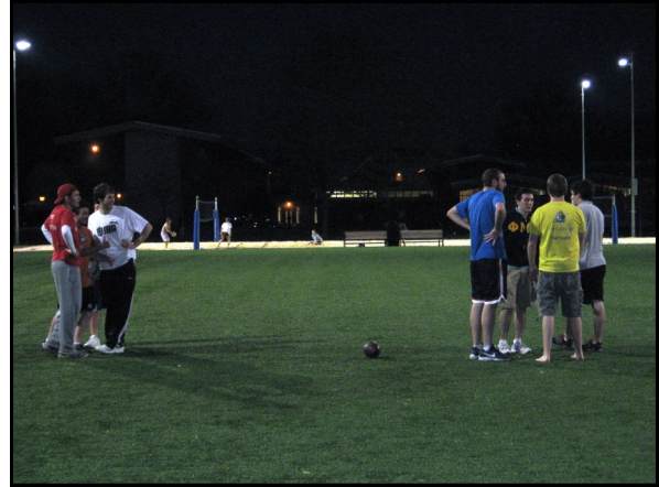
Sinfonians play sports? Apparently so!