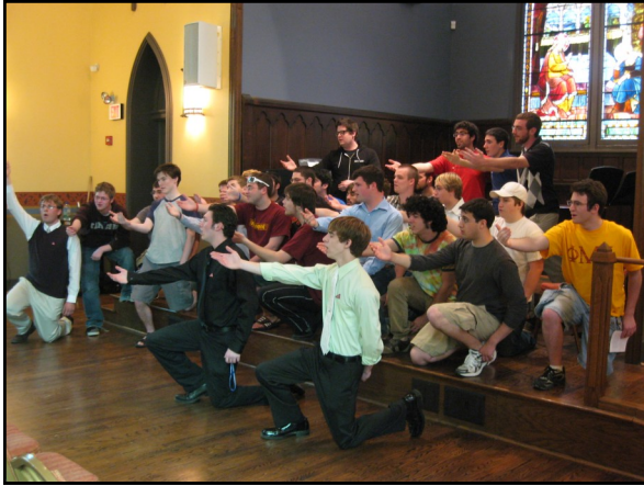
A serenade during the AZ probationary class recital