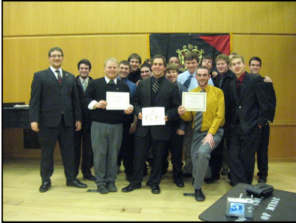
Brothers at P27 Workshop receiving their citations.