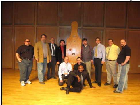
Alumni Ritual Cast