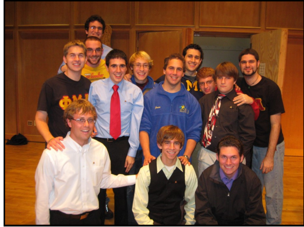
AZ with their ritual cast after their initiation.