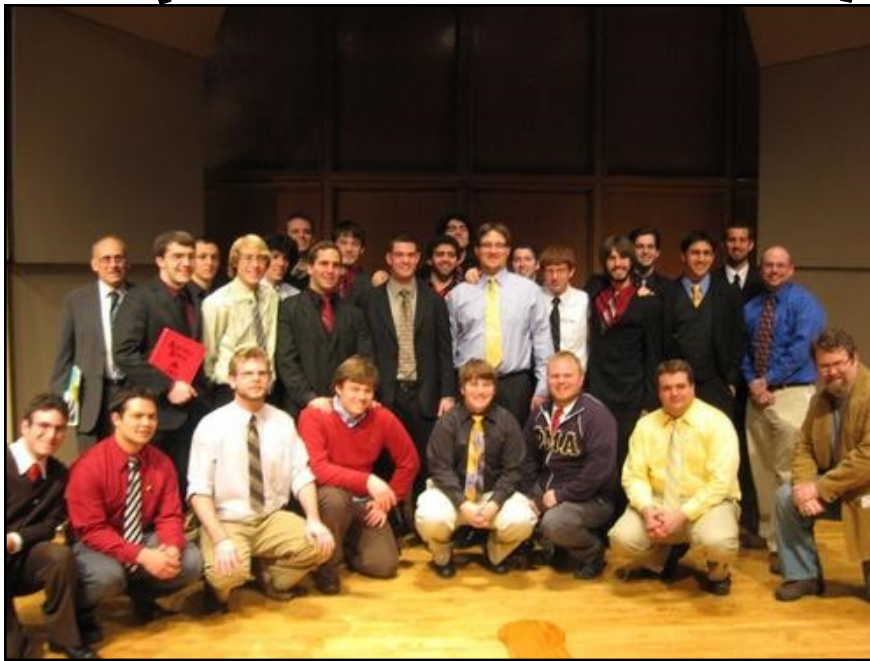
Group shot at the 15th Celebration what they would like