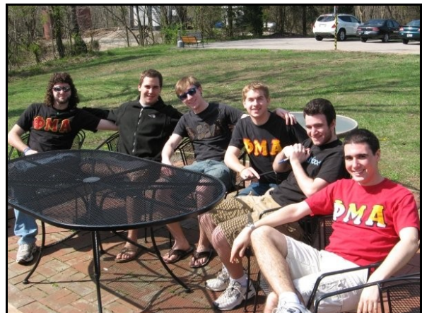
Brothers outside at Lyrecrest.