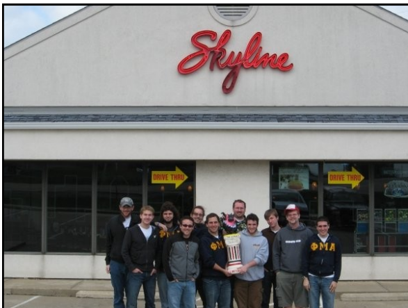
Brothers stopping for lunch at Northern Kentucky University on their way back from Lyrecrest.